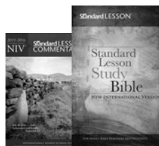
NIV® Hardcover Bundle 025626515 • $49.99 978-0-7847-7822-7