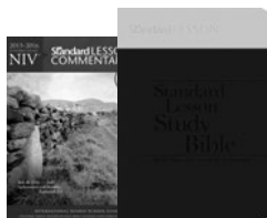
NIV® DuoTone Bundle 025626615 • $59.99 978-0-7847-7820-3

Now, get a FREE Paperback Standard Lesson Commentary® with purchase of any Standard Lesson™ Study Bible !