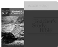
KJV DuoTone Bundle 025627215 • $59.99 978-0-7847-9429-6