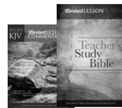
KJV Hardcover Bundle 025627315 • $49.99 978-0-7847-9430-2